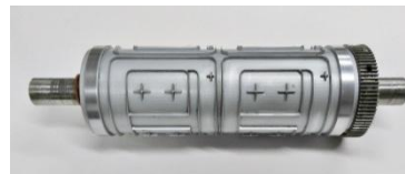
Rotary Die (Kiss cutting)