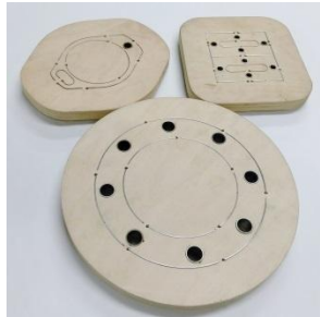
Steel Rule Die

Die cutting is the general process of using a die or tooling to shear webs of low-strength materials, such as rubber, fiber, foam, paper, paper, plastics, thin metals, and pressure-sensitive adhesive tapes.